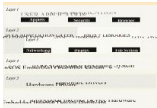
Figure 1. pSOS Embedded JAVA-based Application

pSOS has become the industry's fastest growing real-time operating system with millions of devices running pSOS applications worldwide.